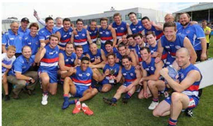
Winners are grinners: The WRFL Senior interleague side take home the cup after beating the SFL by 36-points.

The WRFL withstood early pressure from the SFL, but an unanswered five-goal burst either side of half-time proved the decisive period in the contest.