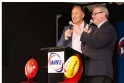
7News sports man Tim Watson guest speaks at the WRFL Season's Launch.