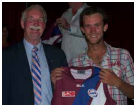
Wyndham City Council Mayor presents the Titans with their jumpers last Friday.