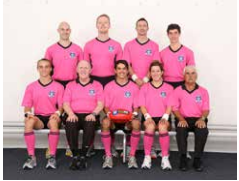
Our WRFL umpires selected to adjudicate at the AFL Vic Metro Championship last weekend.

On Thursday April 10, the WRFL umpires will converge on Saltwater Reserve for a special training