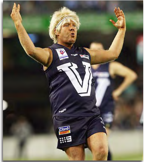
Straunie is back for 2012!

The EJ Whitten Foundation is a leading men's health not-for-profit charity, established with the aim of raising funds for research into the disease & increasing the awareness of prostate cancer. As there are no symptoms in the early stages of prostate cancer, it is vital for a man to begin regular