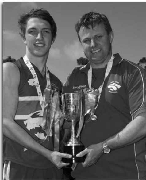
Point Cook celebrate their Division Two flag last season

"Point Cook will also have their home games aligned with their seniors & reserves for the majority of their fixtures."