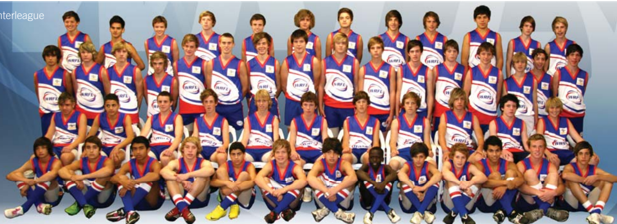
U14 Interleague Squad