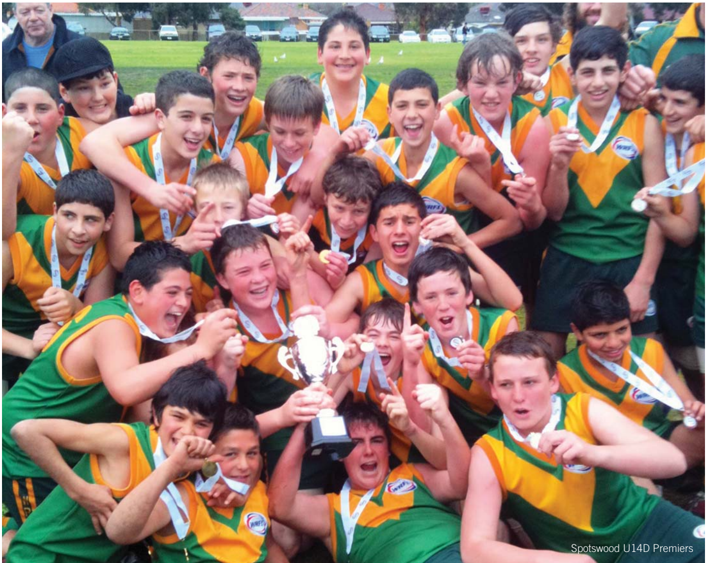
Spotswood U14D Premiers

The Association would like to thank the co-operation of all the WRFL Executive Board and staff for the progress we have made in 2010 and look forward to 2011.