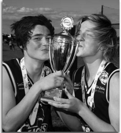
Hoppers Crossing 15A side celebrate their Grand Final win

All players should be congratulated on their achievements. With more than 5000 juniors running around in the western suburbs, these players are the best of the best, and many will no doubt continue on through to an elite level as the likes of Brad Johnson, Callan Ward, Mitchell Wallis & Tom Liberatore have in the past.