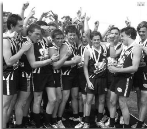
Hoppers Crossing enjoy their 2010 Grand Final triumph

Altona on the other side have done it tough this finals campaign, their week one loss to the Saints a major upset having finished three games ahead of them after the home & away season. Facing the prospect of two weeks of elimination football,