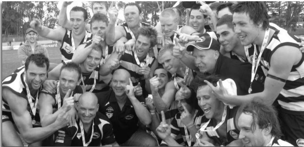
Unlike last year Albion have earned the week off, and will head into their finals campaign as favourites

The Under 18's competitions are also in full swing, the Division One finals taking place at Avalon Airport Oval over the weekend. Saturday sees Altona up against St Albans, the winner facing Hoppers Crossing next week for a right to qualify for the 2011 Grand Final. The Elimination Final takes place on Sunday, Spotswood fighting with Albion to keep their respective seasons alive.