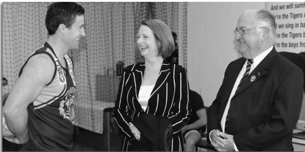
Prime Minister Julia Gillard celebrates another Werribee win in the Tigers clubrooms at Avalon Airport Oval