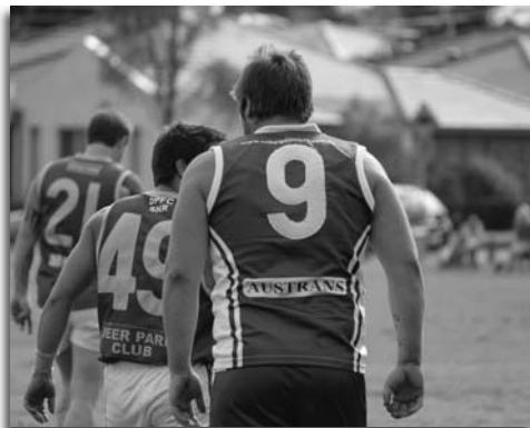
Good Reserves Form Saw Pipe Called Up To The Seniors In Round Six