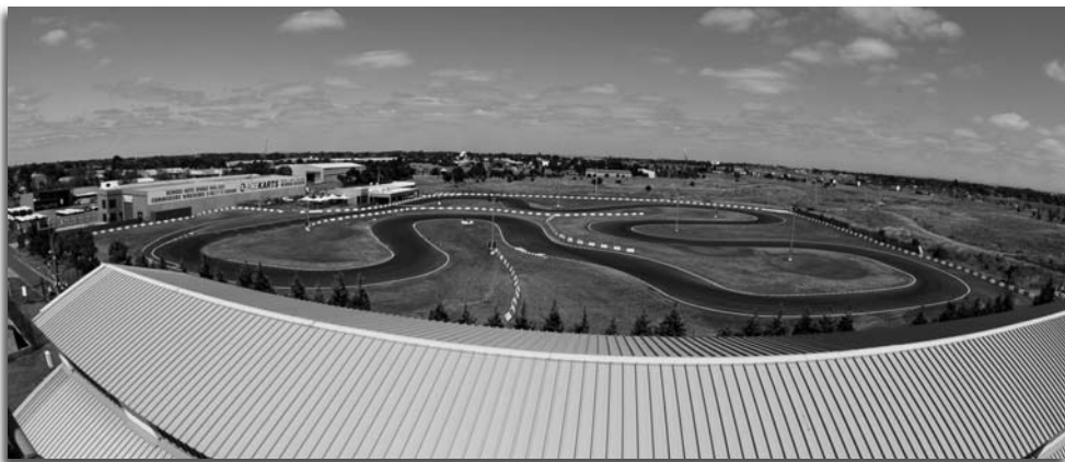
The Picturesque Track Right In The Heart Of The Western Suburbs

Ace Karts is a proud sponsor of the WRFL and is located at 20 Carrington Drive, Albion. Ace Karts can be contacted on 9360 5005 for further information.