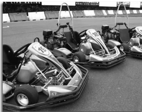
Unleash The Racing Car Driver In You At Ace Karts!

Use this as a pie night, team night or just for an excuse to get out and have some fun.