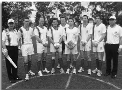
The WRFL Umpiring Team on Grand Final Day 2010

Getting a grand final can be the pinnacle of a career or it can even be a stepping stone to bigger