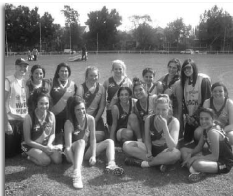
The Williamstown Seagulls Youth Girls Team